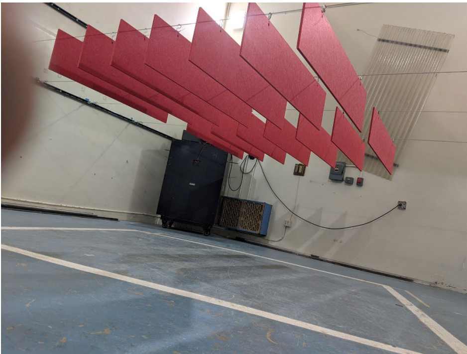
Figure 2 – Specimen mounted in test chamber