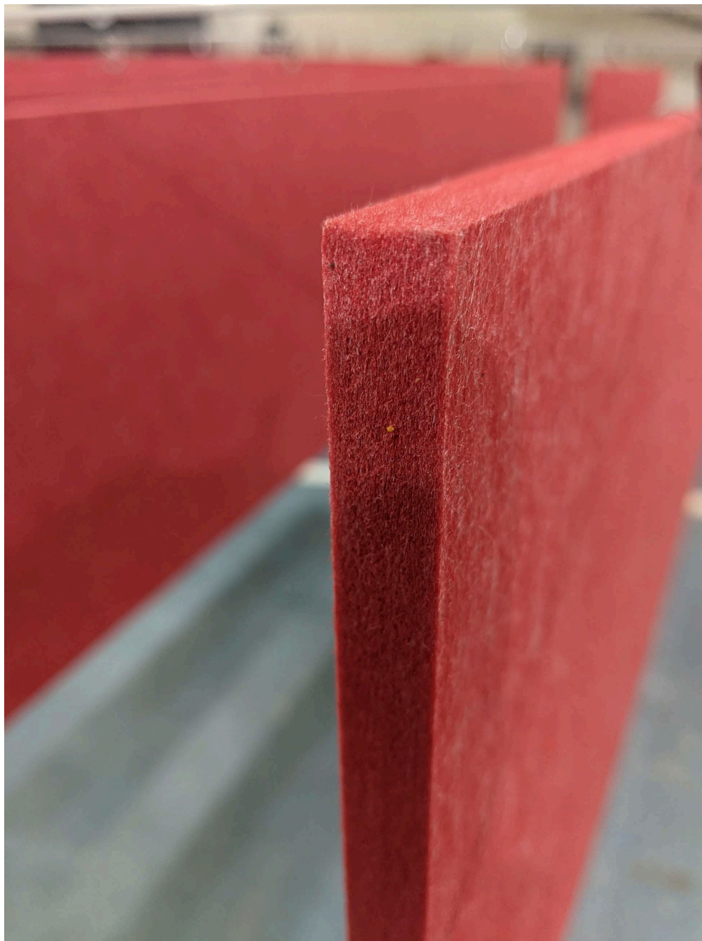
Figure 3 – Detail of specimen material